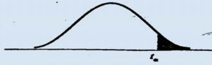
TABLE Critical Values of t